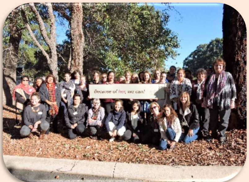
Thank you to everyone who helped us BETA test the women's rubric!