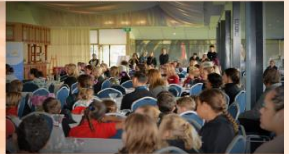
Attendees at the Burswood on Swan

"A huge amount of knowledge was shared along the way. It was an absolute pleasure and a privilege to be part of the discussions and hear the cultural wisdom of other people in the room, to share stories about the important work we all do."