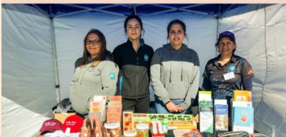
The AHCWA team show their support for the launch! Thank you all so much!