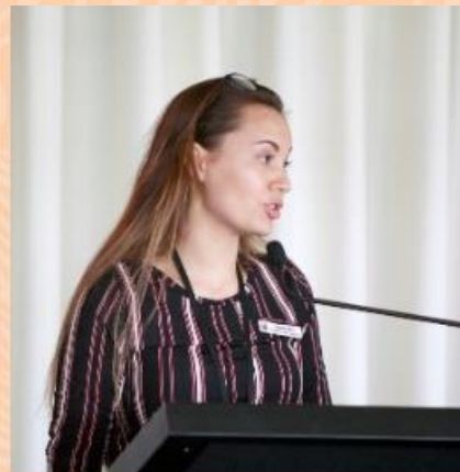
DEANNA HOY EDNEY PRIMARY SCHOOL